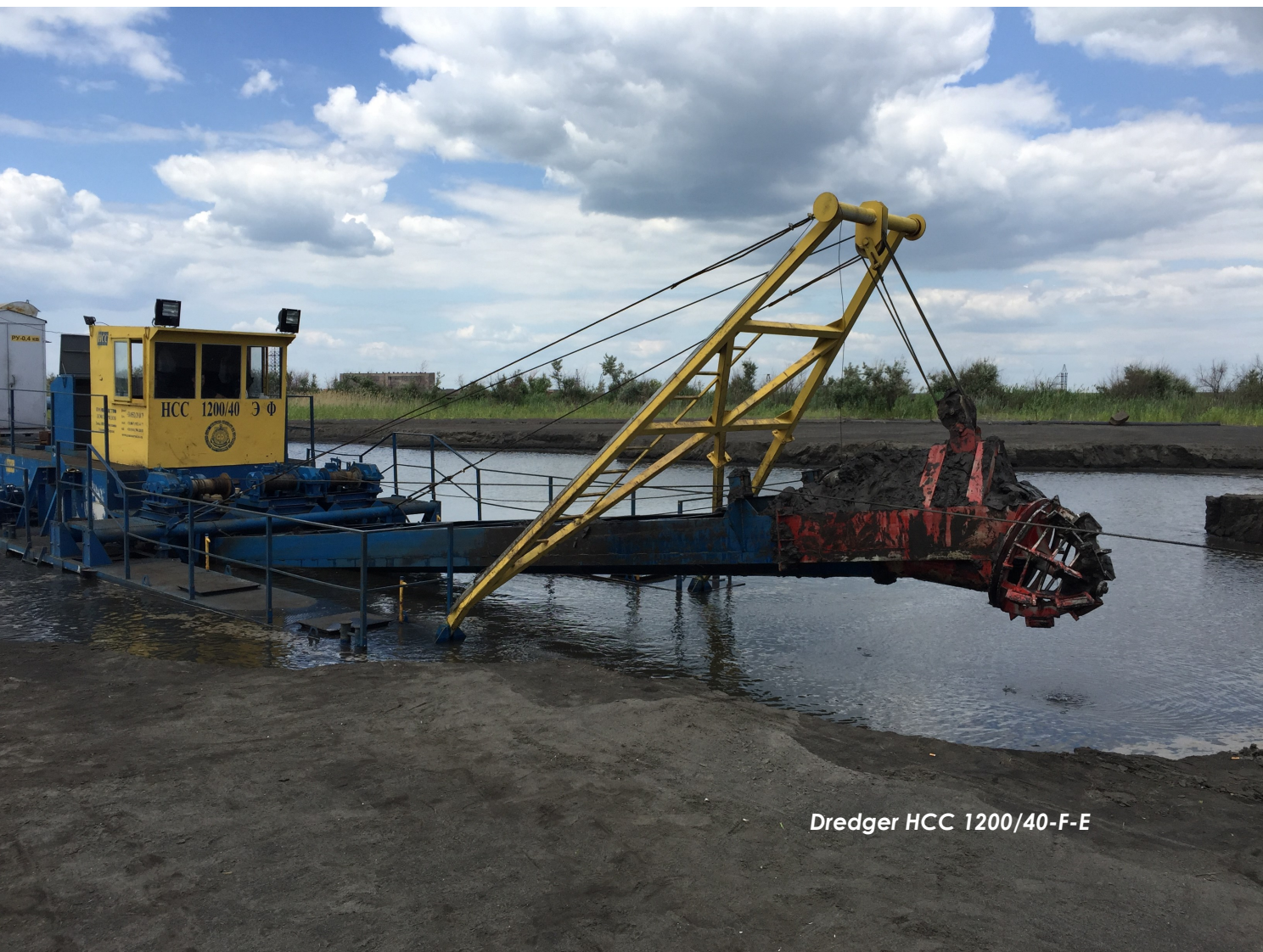
Dredger HCC 1200/40-F-E

Suction dredge HCC brand successfully in different climatic conditions, in an aggressive aquatic environment, as well as with highly abrasive soils.