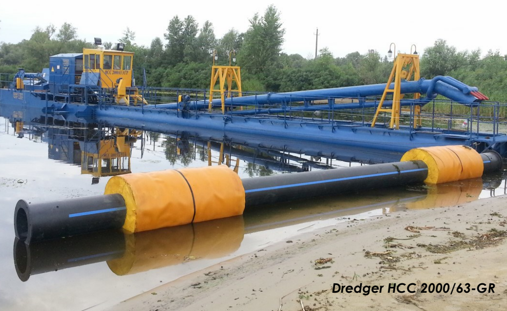
Dredger HCC 2000/63-GR